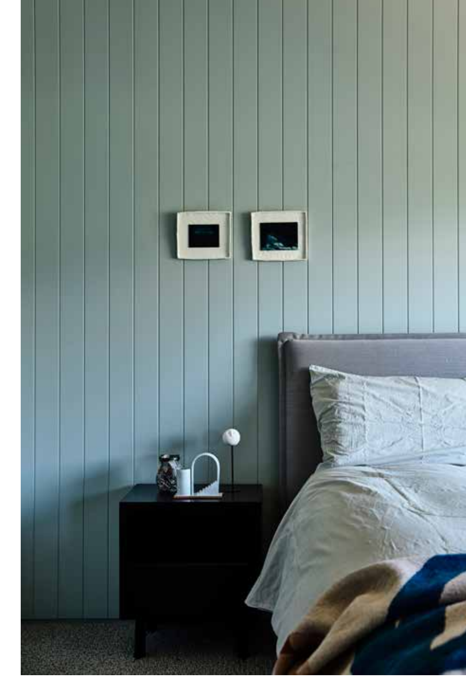
HEDGER CONSTRUCTIONS Building with Distinction